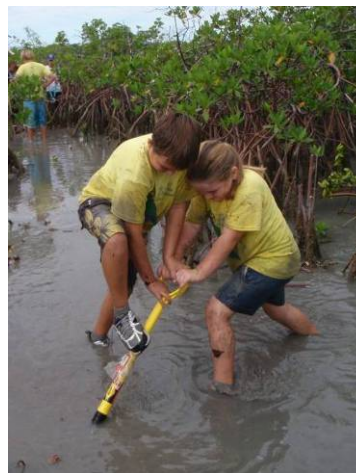
Right: Those mangrove roots sure are hard to pull up! No wonder they provide such good protection to the land!