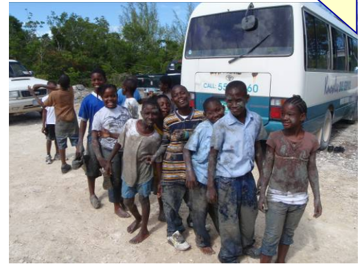
Central Abaco Primary got really hands on at Broad Creek! Here's the muddy proof!