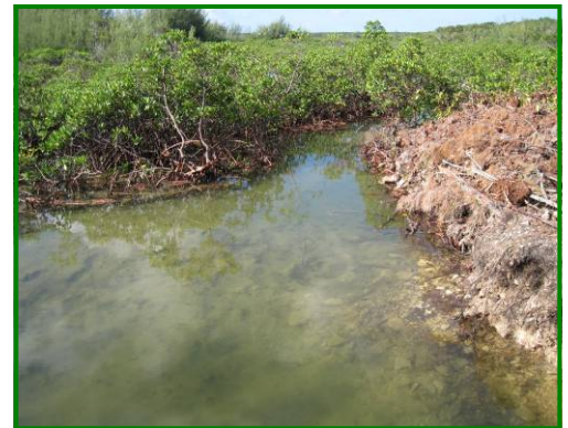
Before and after photos of the downstream portion of the creek. The cleared channel will provide for more natural tidal flow throughout the downstream wetland to the ocean, through the culverts and into the formerly blocked upstream areas.