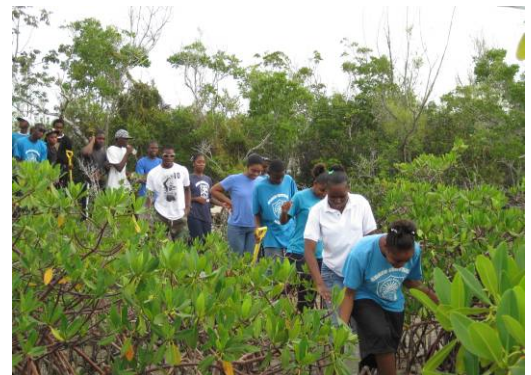
Students of ACH helped refine the channel and tamp down the dense mat of mangrove roots by walking over them.