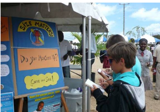
Students visited our Size Matters display at many local events to learn some more facts about Spiny Lobster.