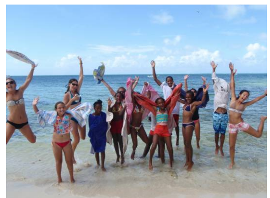
Sandy Point Campers and volunteers share their excitement after a fun snorkel at Mermaid Reef in Marsh Harbour!