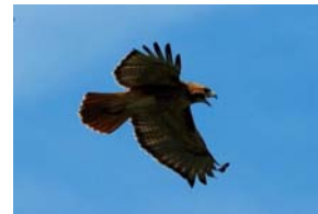
Red Tail Hawk